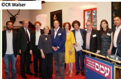
Speakers at Opening