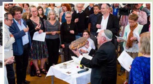
Kiddush in Salomon Sulzer Hall