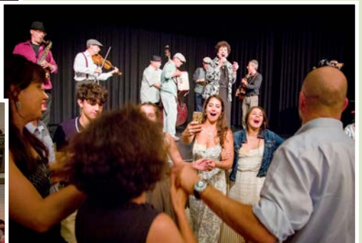
Gala Dinner