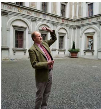
Count of Hohenems in Palace Courtyard