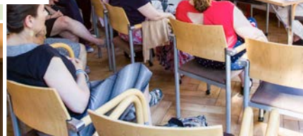
Brunner Workshop ©CR Walser