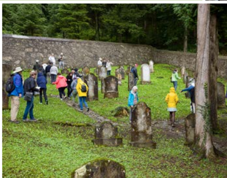
At the Cemetery