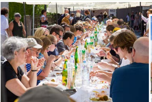
Long Table

Finally came the Gala Dinner at the Löwensaal on Schlossplatz. Music was provided by the local group Bauernfänger. But there were talks too.