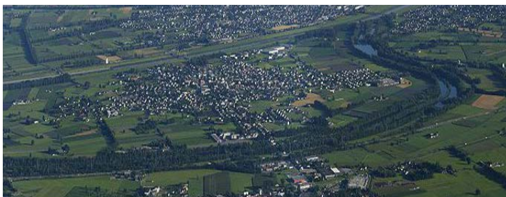
The Alter and Neue Rhein

The Alter Rhein, which formed the border to Switzerland, was an abandoned river course of the “Neuer Rhein.” Ever since the river regulation and the creation of the “Neuer Rhein” in the 1920s, the Alter Rhein carried very little water and hence constituted a traversable section of the demarcation line. At several points, it was even possible to reach dry-shod the Swiss community of Diepoldsau, located across the Alter Rhein from Hohenems.