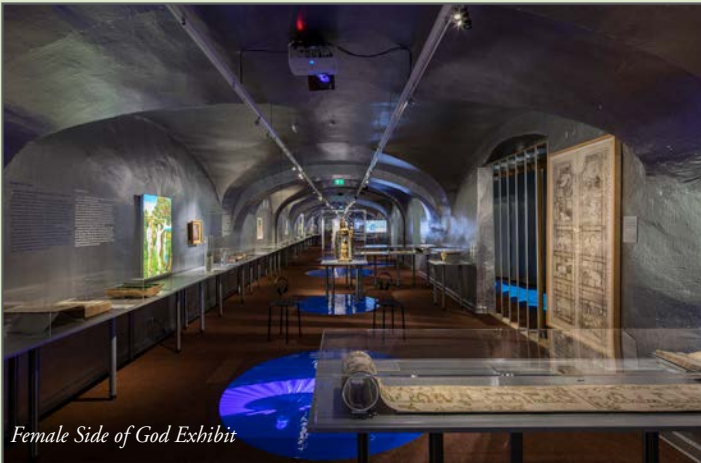
Female Side of God Exhibit

We all have enjoyed a great year at the Museum. The Reunion, in July, celebrated the 400th anniversary of the beginning of Jewish history in Hohenems. Our exhibition “The Female Side of God” brought more visitors to the Museum than any other exhibition in the past. So this year we will have about 19,000 visitors, an incredible development, and a great challenge for our team and the small villa that is waiting for all these guests.