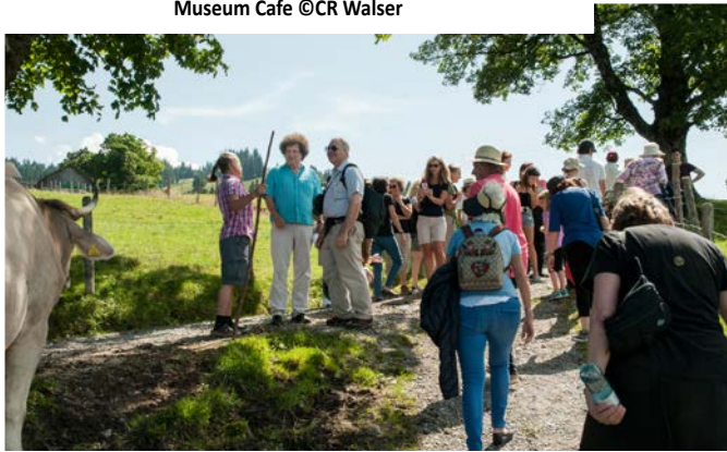
Hiking in the Bregenzer Wald