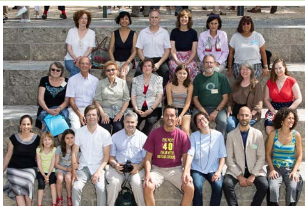
The Brunners