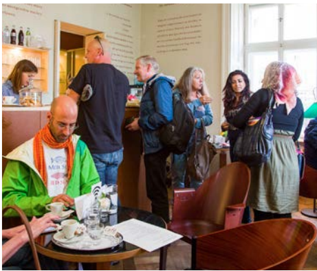
Museum Cafe