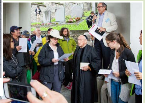
Kaddish at Cemetery