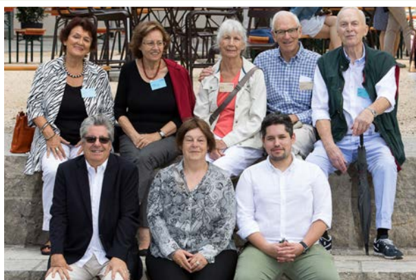
The Reichenbachs