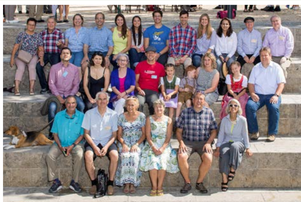
The Hirschfelds ©CR Walser