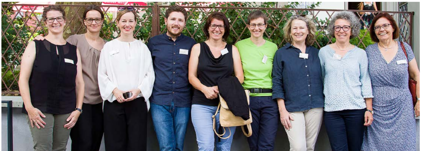
The Guides in Front of the Museum

And with that in mind, I wish you a great event and a pleasant stay in Hohenems.