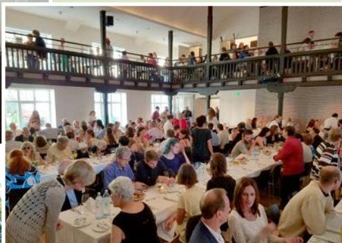
Gala Dinner