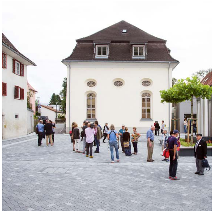
Salomon Sulzer Platz