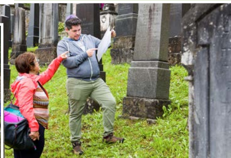
Searching for Ancestors in Jewish Cemetery ©CR Walser