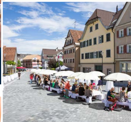
Long Table ©Dietmar Walser