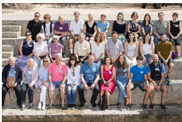
The Rosenthals