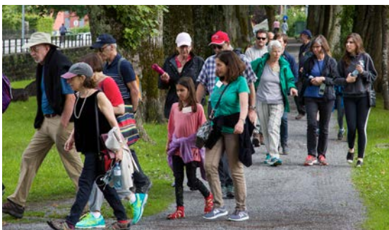
at the Emsbach

For several years now, the Jewish Museum has been offering its visitors the opportunity to trace the steps of those refugees and to hear their stories while walking from the Museum to the Alter Rhein and beyond into Switzerland. During the Reunion 2017, many descendants from around the world set out together on an excursion into the countryside and, at the same time, into history.