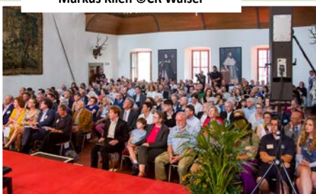
Opening Ceremony