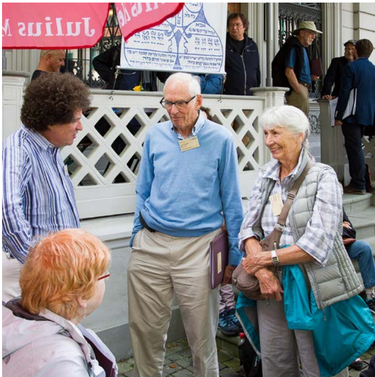
In front of the Museum