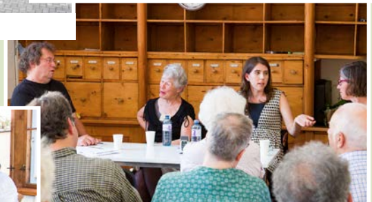
Workshop– Rosenthal