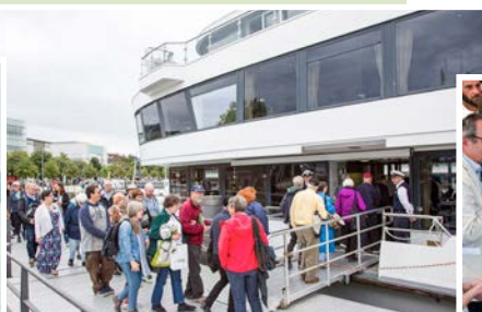
Boarding Boat on Lake Constance/Bodensee