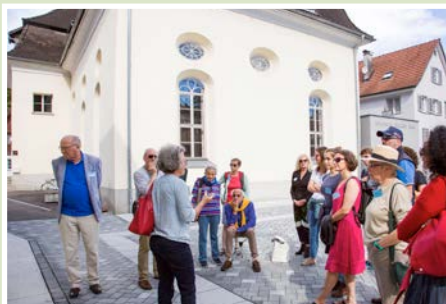
Tour of Jewish Quarter