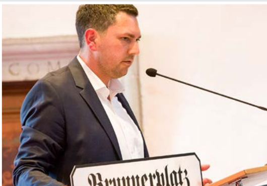
Markus Kien

DELIVERED BY MARKUS KIEN OF THE CITY COUNCIL OF HOHENEMS, AT OPENING CEREMONY