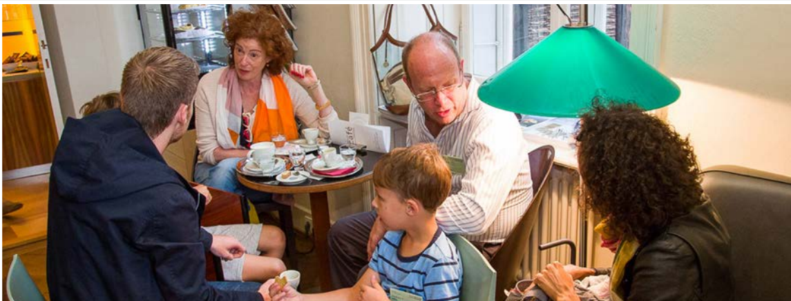
The Jaffé Family