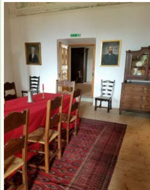
Palace Interior