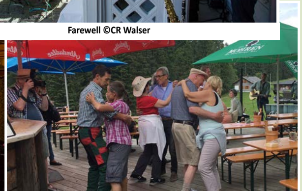
Dancing with locals at the Farmer's Inn in Bregenzerwald