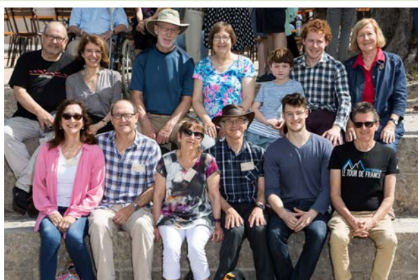
The Sulzers