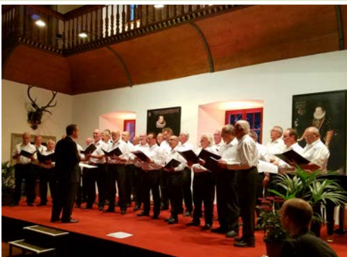
Hohenems Male Choir

On July 29, we had the opportunity to take those tours we had missed the previous day. Then we all met at the Emsbach at the Schlossplatz and the group photo reproduced on the last page of this newsletter was taken. In addition separate family photos were also taken.