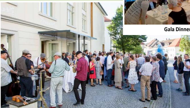
Outside Löwen Saal before Gala Dinner