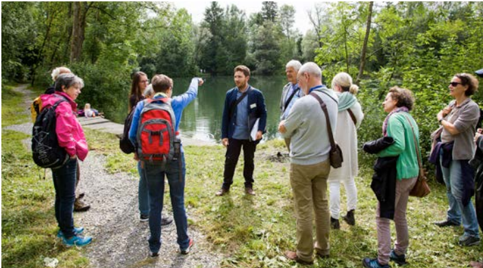
Refugee trails - at the old Rhine