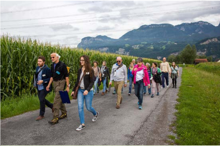
refugee trails