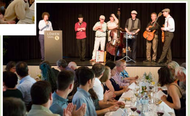
Gala Dinner