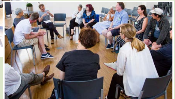
Workshop– Anti-semitism in Vorarlberg; Jewish Life in Tyrol