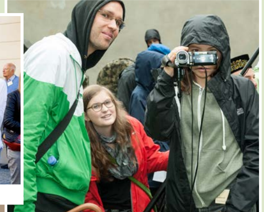
Photographers at work