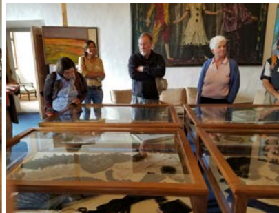
Palace Interior