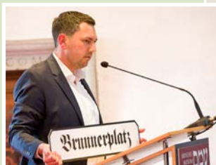
Markus Klien ©CR Walser