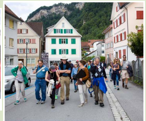
Tour of Jewish Quarter