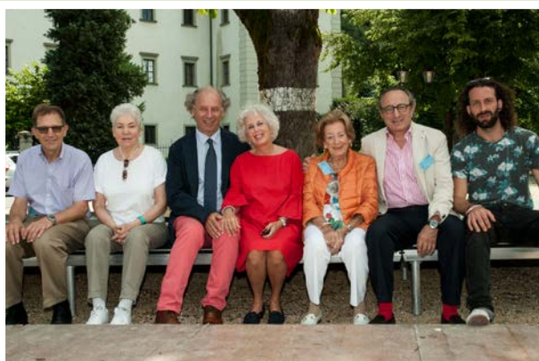
The Landauers ©Helmut Schlatter