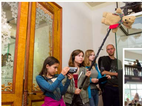
Photographers at Work