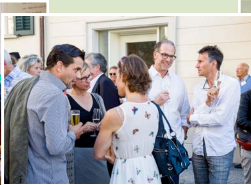
Outside Löwensaal